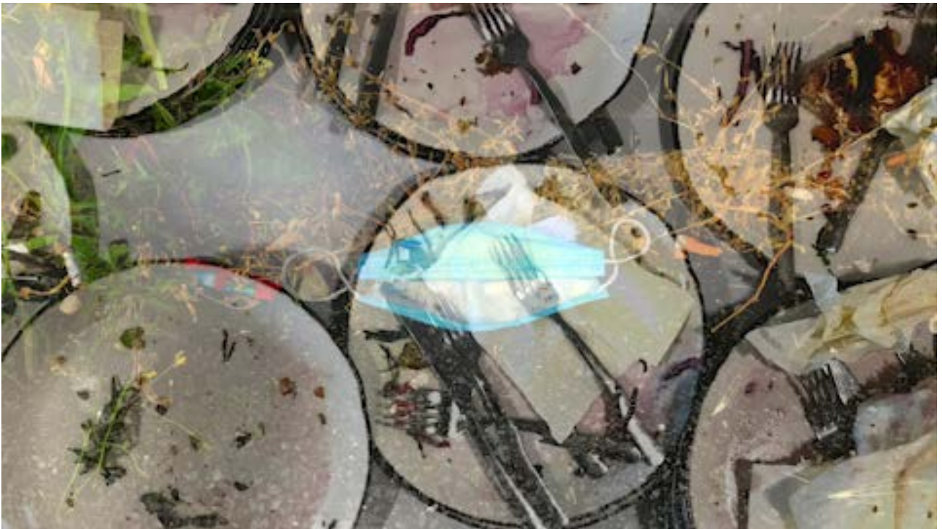
Image: Still from 'The Desert Mountains & Dreary Glaciers are My Refuge' or 'The Follicle Distancing in Glacial Increments' by Ashokkumar Mistry .

We premiered the second Awkward Bastards at Home film: 'The Desert Mountains & Dreary Glaciers are My Refuge' or 'The Follicle Distancing in Glacial Increments' by Ashokkumar Mistry .