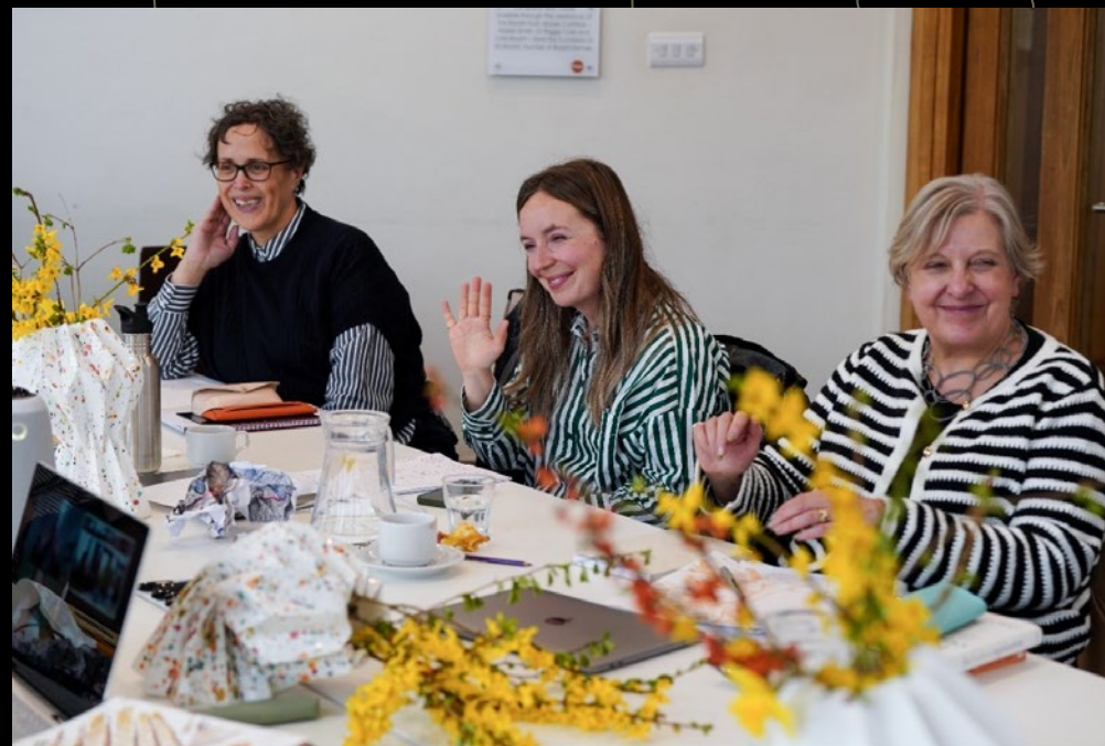
FCP partners meeting at MAC. 2024.

As part of the broader FCP initiative, all partners will work together and independently to deliver a variety of activities that not only involve a newly appointed Curator-in-Residence but also extend beyond the role. These activities will include events, exhibitions, art commissions, projects, training, professional development, and organisational learning.