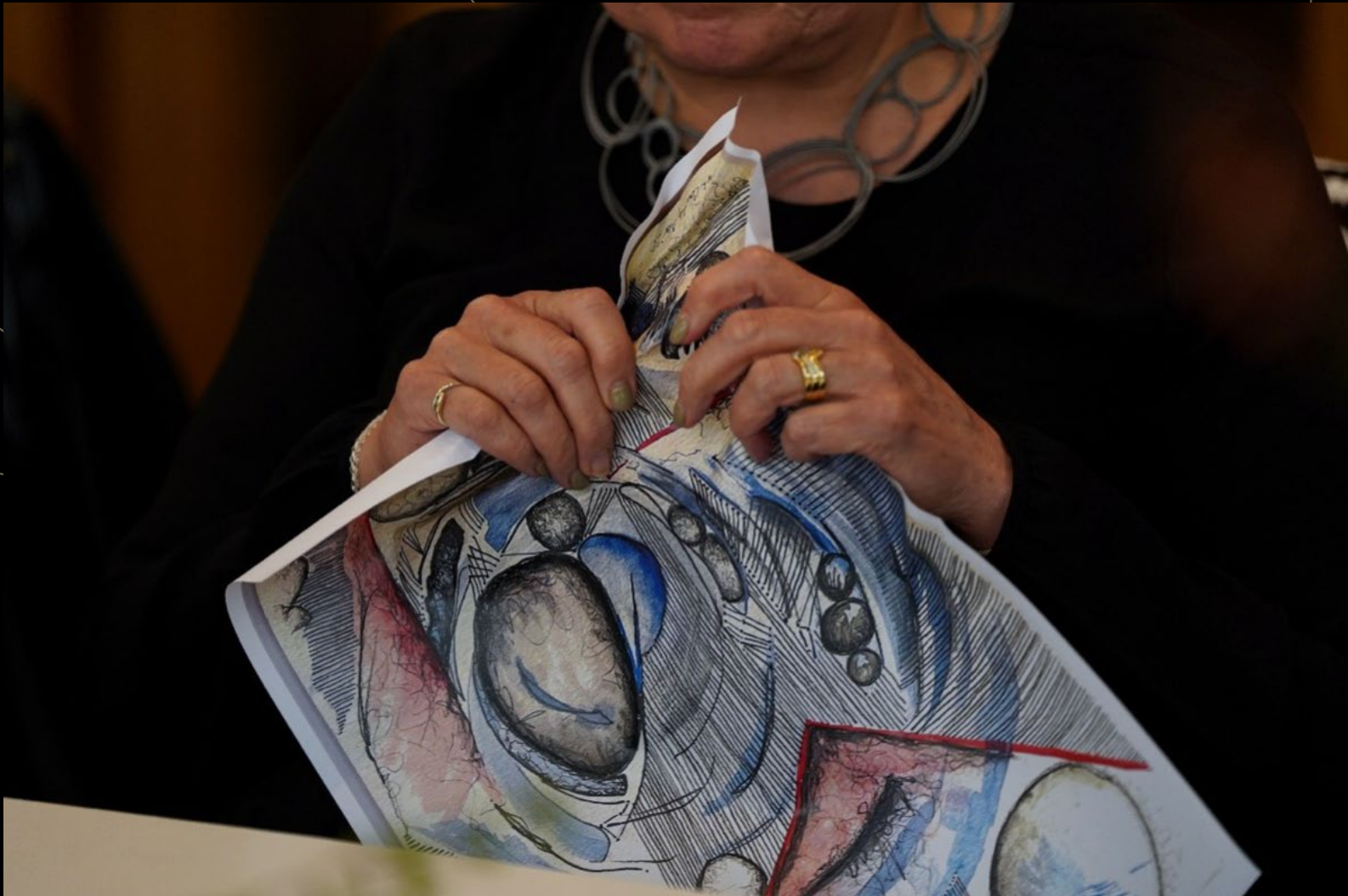
Sculpting FCP at a network meeting in 2024.

Image Description: A close-up of two hands in the process of crumpling a sheet of A4 paper. On the paper is a blue, black, red and white abstract drawing made up of many lines and circular shapes.